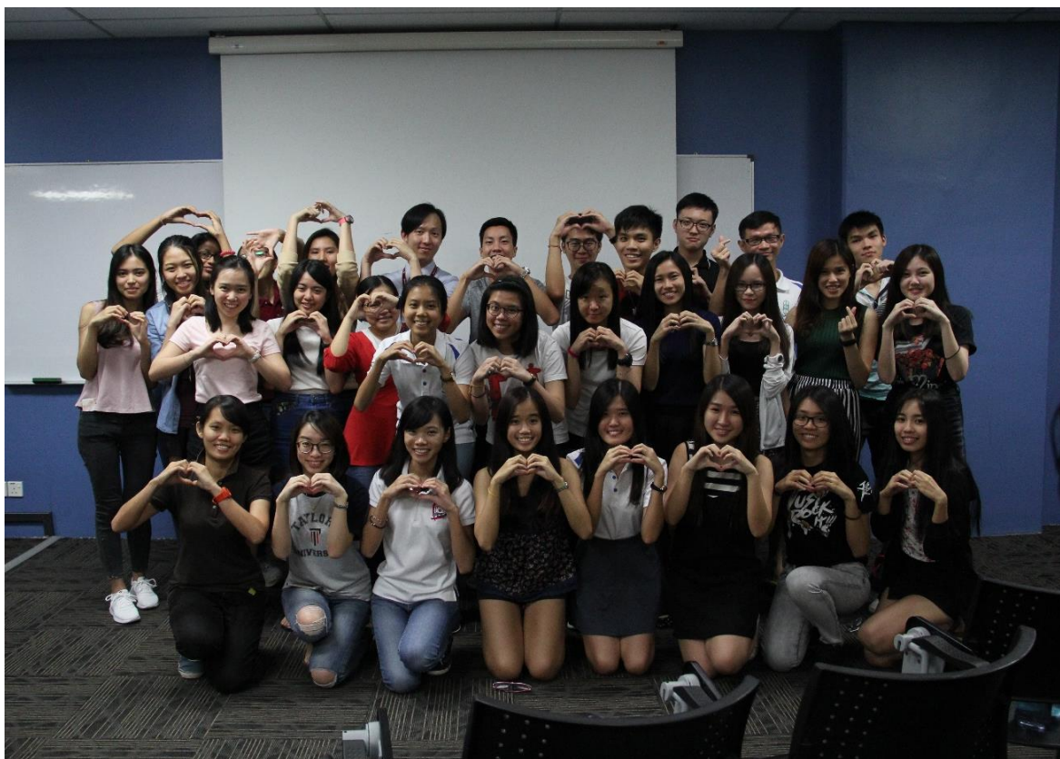
9/6/2017 Taylor's University Pharmacy Students' Society (TuPSS)

You and Me Educational Program was conducted in Taylor's University Lakeside campus. The attendees were lively and bright students from Taylor's University Pharmacy Students' Society (TuPSS). Through this sharing session, the students are made aware of the role they can play in charity. Many great ideas were brought up in the sharing session to address the social issues most important to them. You & Me Educational Program aims to aid the students in executing their ideas into feasible projects. They have even started planning to organise a charity event in partnership with GHCA at a centre for the disabled very soon. We hope to see many more young minds involving themselves in charity.