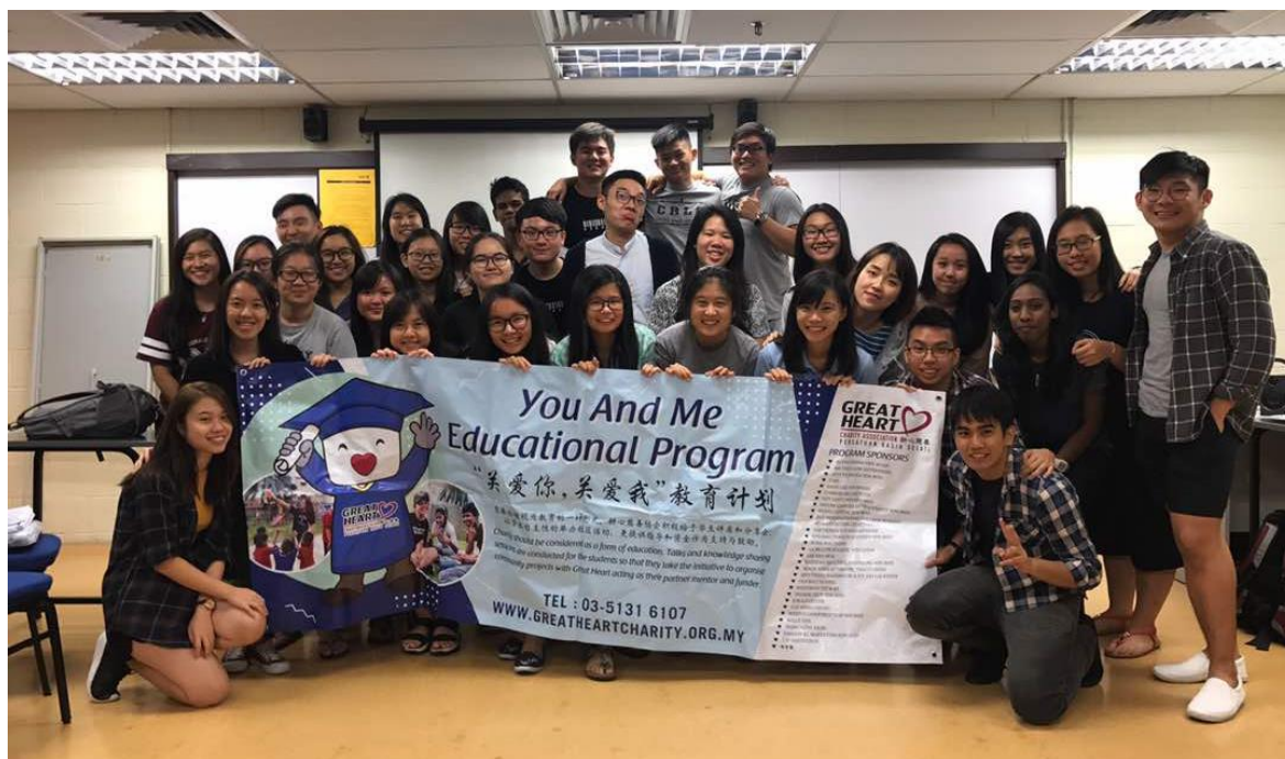
22/5/2017: AIESEC in Sunway

You and Me Educational Program sharing session was conducted for AIESEC in Sunway University and UTAR Community Society Service (CSS) in UTAR Sg. Long with 32 and 25 attendees respectively. Being an active voluntary body in the respective universities, both AIESEC in Sunway and UTAR CCS hold strong to the value of delivering positive impact to the society.