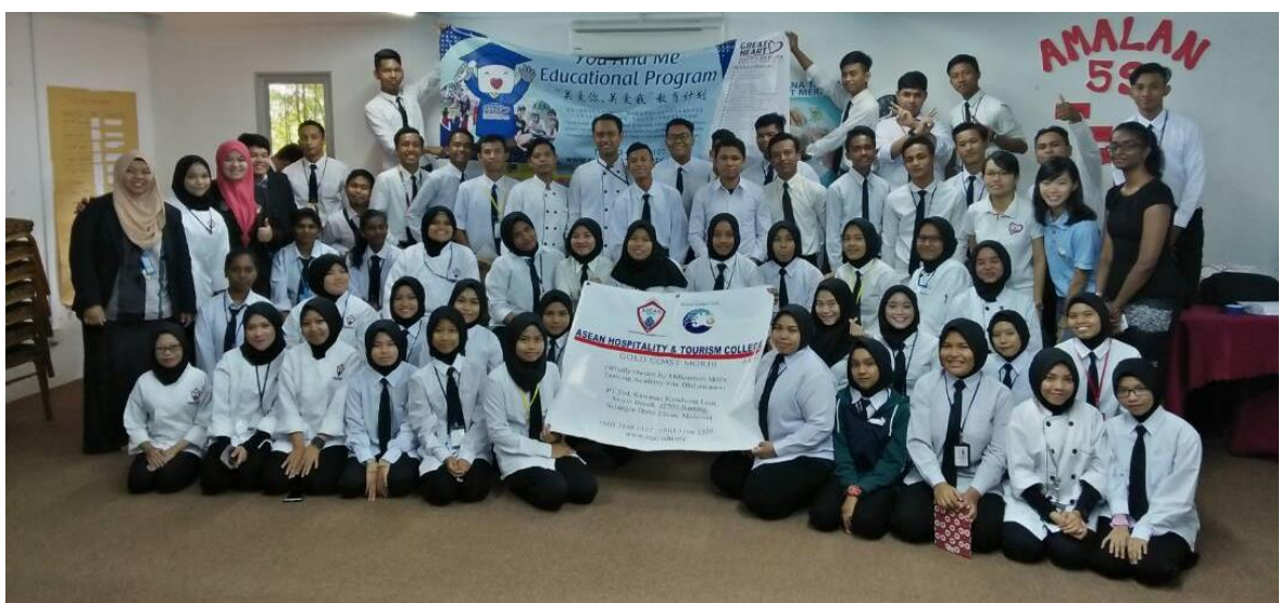
26/4/2017: ASEAN Hospitality and Tourism College, Morib.