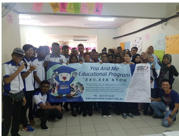
10/4/2017: Global EDU Training Centre, Klang.

Great Heart Charity Association has conducted a “You and Me Educational Program” sharing session in three academies under the Millennium Skill Training Academy group: Global EDU Training Centre (Klang), ASEAN Culinary Academy (Setia Alam) and ASEAN Hospitality and Tourism College (Morib). A total of 180 students participated in the session and actively shared their opinions on charity works and what charity means to them. Understanding their strength and ability, most of them offered to contribute to charity with their learnt skills apart from contributing in terms of time and monetary support.