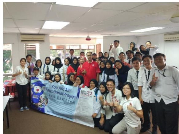
17/4/2017: ASEAN Culinary Academy, Setia Alam