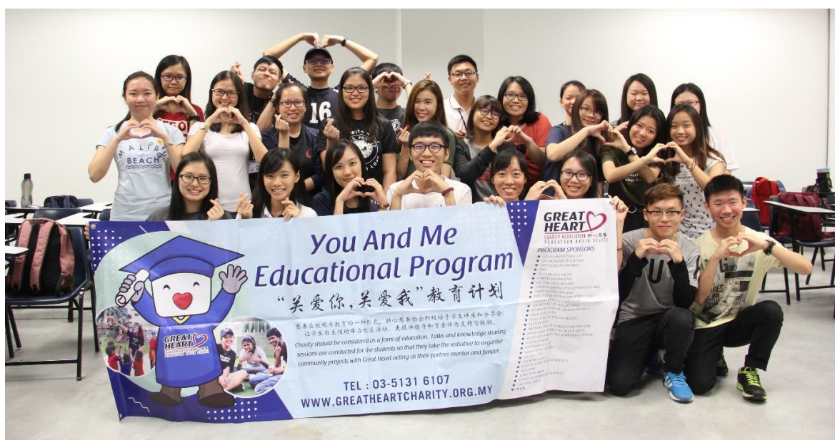
31/5/2017: UTAR Community Society Service (CSS)